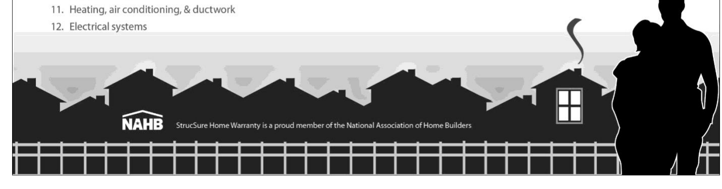
*Please reference your Warranty Coverage Booklet for specific terms, conditions, and exclusions.